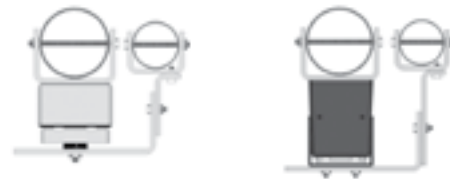
FMK-SW shown with M62FG